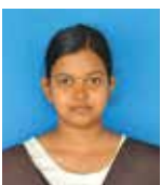
Riya J 700