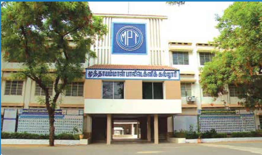
Muthayammal Polytechnic College

Mechanic (Motor Vehicle), Electrician, Fitter, Wireman Refrigeration & AC (Mechanic)*