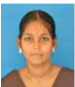
Atchaya K 700