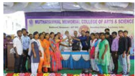
Best Department Award