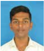
Gokulakannan D 700