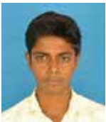
Jeevan V 700