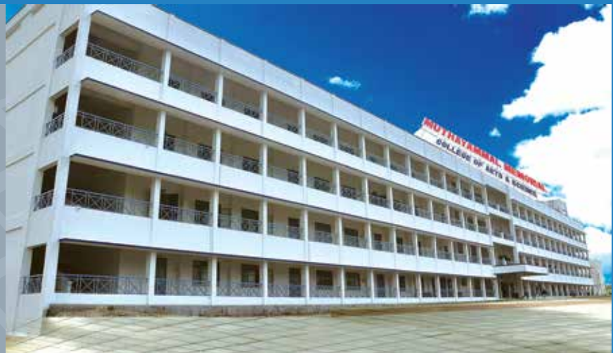
Muthayammal Memorial College of Arts & Science