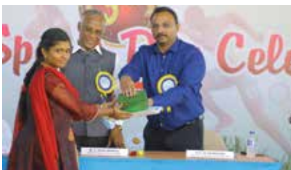
Best Student Award

She achieved III rd Place in ALL INDIA LEVEL Power lifting Competition